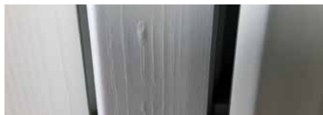
Unevenness of timber.

Due to complexity, angular and multifaceted of our products there is a possibility that paint cannot reach into every single corner . For example the paint cannot reach little holes that are caused by hanging hooks. Changes in the material due to temperature and humidity might happen which can affect the painted surface. Resin can be released and be visible through the paint and cracks in the painted surface might occur. For maintenance please follow the below recommended actions. Some of our painted products are already assembled and ready for use. Other products need assembling, for example picnic-tables. By these products paint has also covered joints so that by assembling these places may be more dense. After assembling painted products meet outdoors different weather conditions like wind, rain, sun etc. Colour differences on a small scale of painted products is allowed.