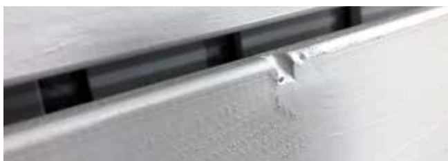
Knots on surface.

Since surface of timber is embossed, painting brings out the unevenness of timber . One of the most common defects of timber are knots which are more visible after painting .