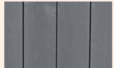
RAL 7016 - dark grey