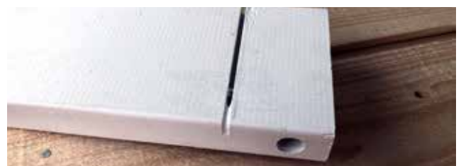
Paint in a groove of a detail.

Yearly inspection and maintenance and re-painting when needed is recommended. For white painted products use water based paint with color code RAL 9016, for grey painted products color code RAL 7016. Store dry outside away from direct sunlight. Do not store indoor in warm areas.