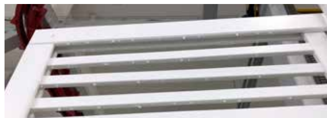
Paint drops on products.

Since surface of timber is embossed, painting brings out the unevenness of timber . One of the most common defects of timber are knots which are more visible after painting .