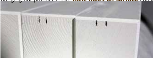
Staple gun marks.

Painted products can have staple marks , which are caused by labels that are fastened to a product with staple gun before painting. For painting products from all four sides, products hang in the air with help of hanging hooks. Due to hanging our products have little holes on surface caused by hanging hooks.