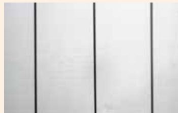
RAL 9016 - white

We paint our products with two layers of white or grey paint to give extra protection and a nice elegant look.