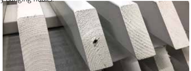
Little holes caused by hanging hooks.