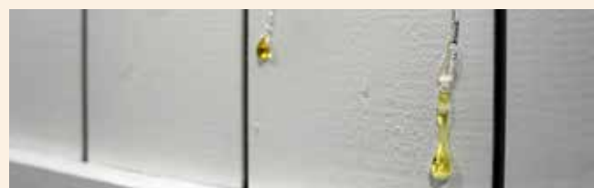
Resin can be released.

All peculiarities mentioned in this document (staple gun marks, little holes caused by hanging hooks, paint drops, knots on surface, unevenness of timber, paint not reached into corners, resin coming through the paint and cracks, paint in grooves, colour differences on small scale) are not reasons for claims.