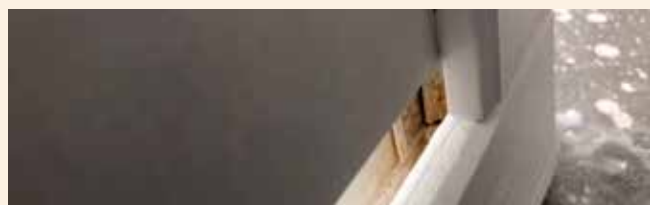
Paint cannot reach into every single corner.

Due to complexity, angular and multifaceted of our products there is a possibility that paint cannot reach into every single corner . For example the paint cannot reach little holes that are caused by hanging hooks. Changes in the material due to temperature and humidity might happen which can affect the painted surface. Resin can be released and be visible through the paint and cracks in the painted surface might occur. For maintenance please follow the below recommended actions. Some of our painted products are already assembled and ready for use. Other products need assembling, for example picnic-tables. By these products paint has also covered joints so that by assembling these places may be more dense. After assembling painted products meet outdoors different weather conditions like wind, rain, sun etc. Colour differences on a small scale of painted products is allowed.